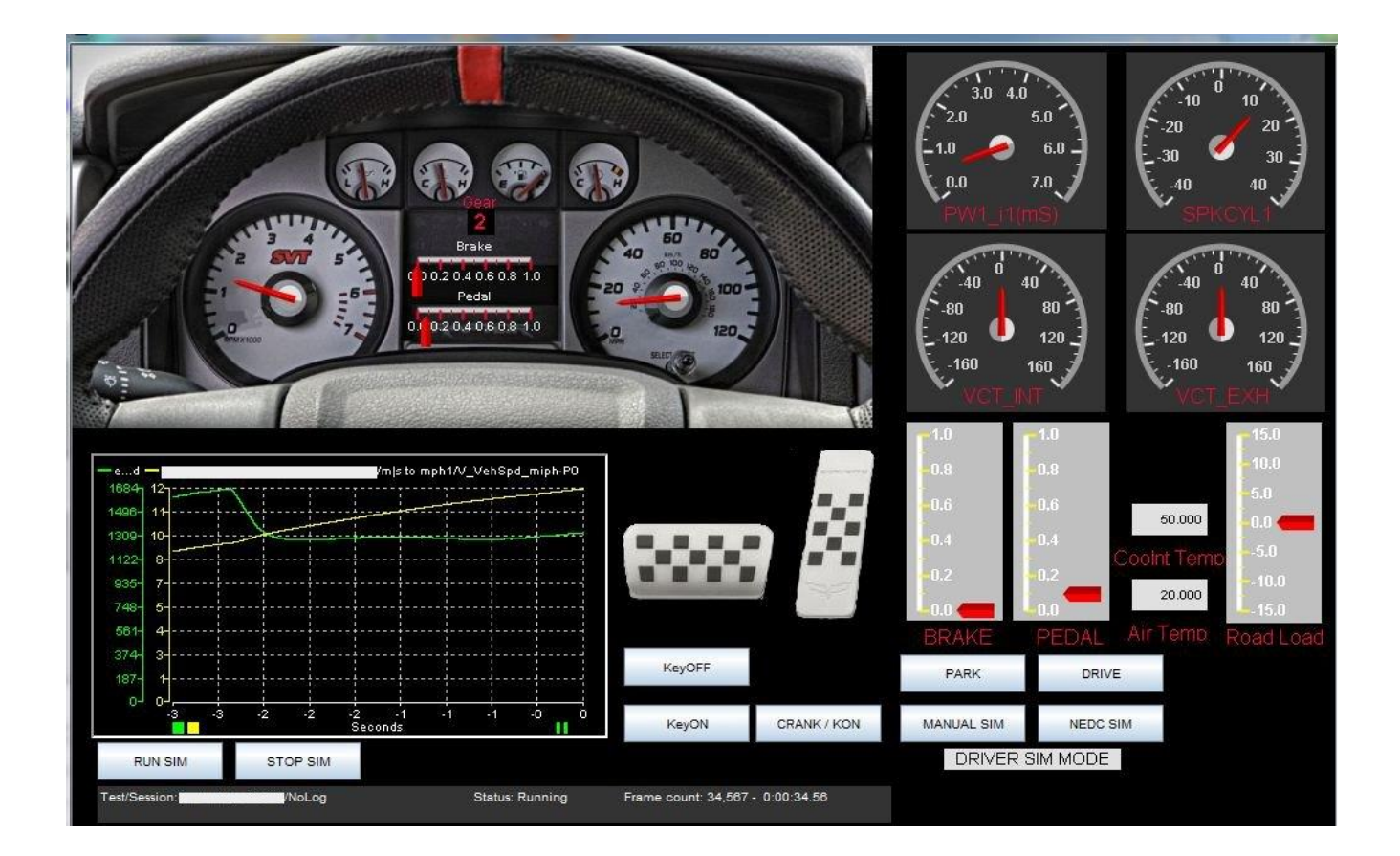
Fig. 3 - Ford HMI

The interactive environment also takes advantage of the rich set of display and control widgets available from the SimWB human/machine interface (HMI) or GUI builder. These widgets include things like buttons and sliders, gauges, LED's and active SVG elements. The display widgets can be connected to any item in the RTDB. They are Java based, so the same HMI will work on either Linux or Windows. As an example, Fig. 3 is an HMI that Ford test engineers use to drive the simulation and monitor a few key model outputs.